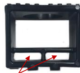
Slots for Carrier Approved Mounting Hardware Up To 1/2" Wide