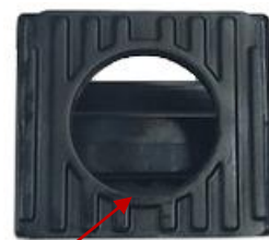
3/4" hole for mounting Snap-in Hangers