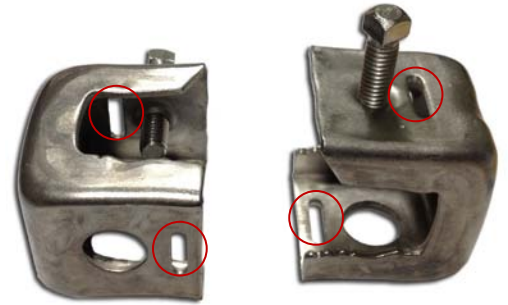
TH514-UA3 shown with slits for optional installation with stainless steel banding

Angle Adapters provide a durable means for securing coaxial cable to solid angle members or to angle members where pre-punched holes are not easily accessible. The adapters accommodate snap-in hangers via two 3/4" pre-punched holes. The TH514-UA3 Large Universal Angle Adapter also includes slits for optional installation with stainless steel banding.