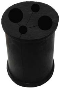
Conceptual image shown

HANGER ADAPTER GROMMET FOR TWO 10-2 POWER AND TWO 7 MM FIBER JUMPERS. USED WITH 1-1/4" HANGERS AND DOUBLE BLOCKS (KIT OF 10).